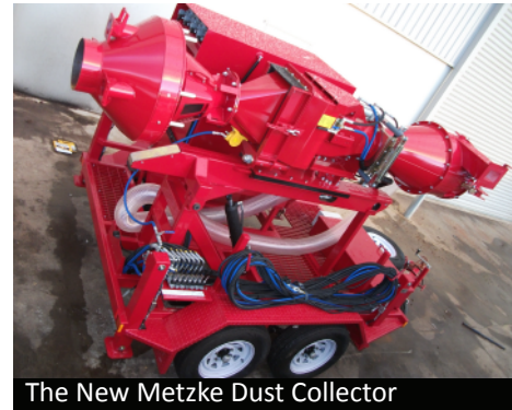
The New Metzke Dust Collector

The dust collector operates with hydraulic jack legs to enable the cyclone/splitter to be set up and compensate for any ground deviation to enable the sampling split to be equal and produce a clear representation of the ground.