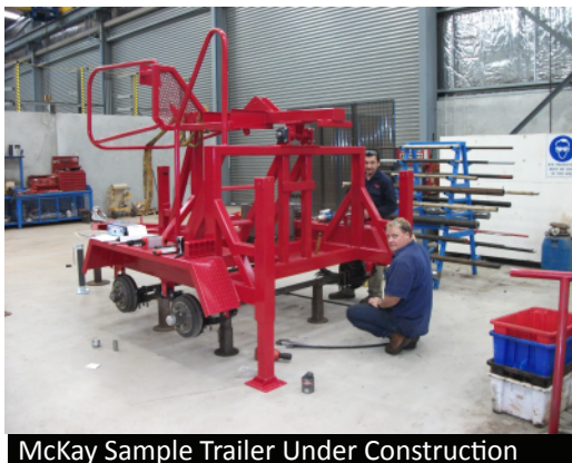
McKay Sample Trailer Under Construction