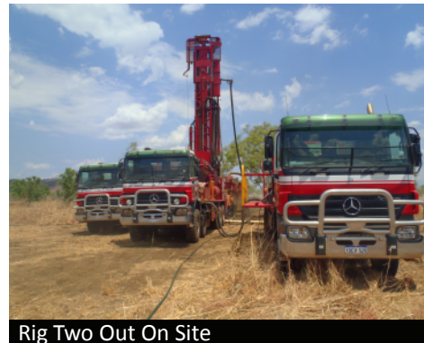
Rig Two Out On Site

R ig Two is near to completion on its current drilling program, early next month it is bound for the Gulf of Carpentaria in the Northern Territory to undergo another drilling program scheduled to last the remainder of the year.