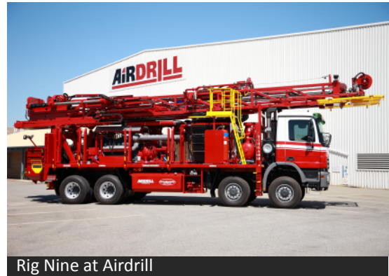
Rig Nine at Airdrill