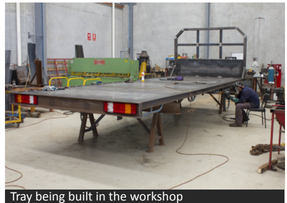
Tray being built in the workshop

T he old truck carrier for Rig one is being built up as a water truck for the Diamond Rig. It's keeping the boys in the boilermaker shop very busy with having to get the new Truck out.