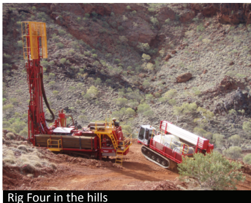
Rig Four in the hills