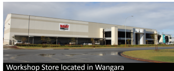
Workshop Store located in Wangara

T he stores department is currently undergoing an audit in preparation for the implementation of a new software program which will control all incoming and outgoing stock associated with all areas of the company's operations.