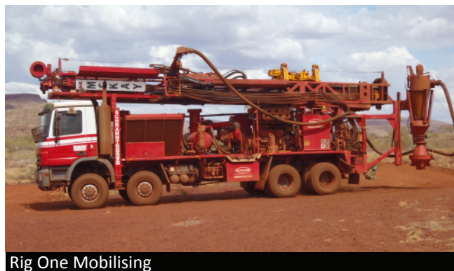
Rig One Mobilising

hazards around us we can prevent serious injuries from happening to ourselves and other employees.