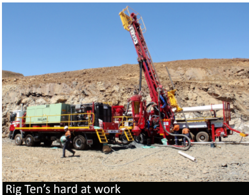
Rig Ten's hard at work